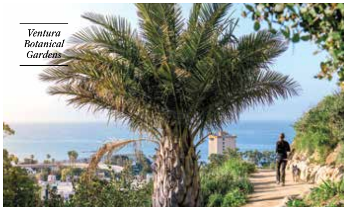
Ventura Botanical Gardens

rapper Notorious B.I.G. (both, for example, were born and bred in Brooklyn) after a popular Tumblr blog first made the comparison. The biography that followed, Notorious RBG: The Life and Times of Ruth Bader Ginsburg , has now been transformed into an exhibition at the Skirball Cultural Center . The galleries split the difference between playful and educational; each is titled after the late hip-hop artist's lyrics—think “Stereotypes of a Lady Misunderstood” and “Don't Let 'Em Hold You Down, Reach for the Stars”—and R.B.G.'s briefs and writings are woven throughout, including some of her most searing dissents. Through March 10 ; skirball.org .