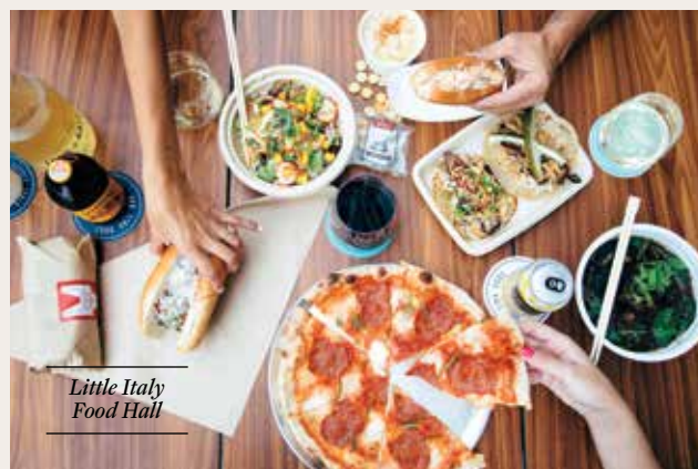
Little Italy Food Hall