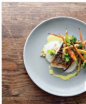
Clockwise from left: Alcazar dining area at Hotel Californian; seared Barramundi with celery root puree from Finch & Fork; the Ritz-Carlton pool has ocean views. Bottom right: The Santa Barbara Museum of Art